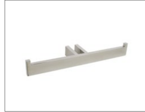
Twin Toilet Roll Holder