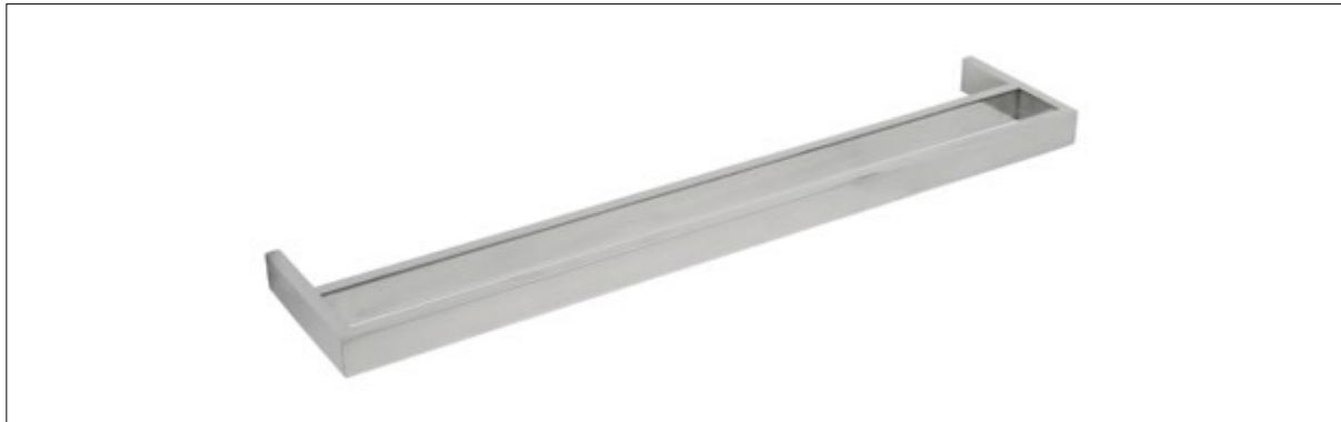
Double Towel Rail