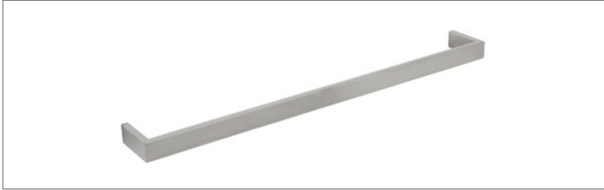
Single Towel Rail