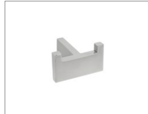
Twin Robe Hook