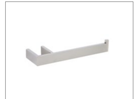
Hand Towel Holder