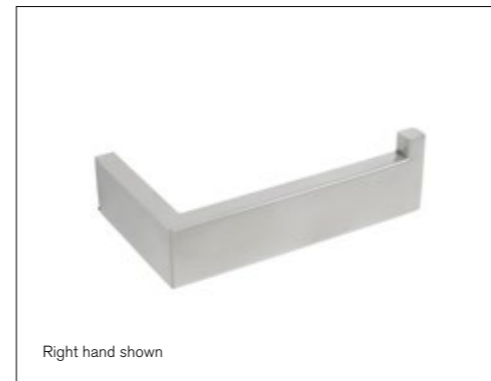
Toilet Roll Holder